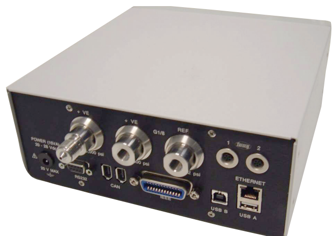
PACE1000 from the rear